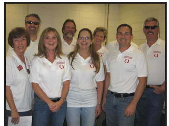
LEADERShip Martin County Adult and Youth Programs kicked off in September. These Alumni members worked hard to produce a successful SimSoc weekend for LEADERShip Class 21.