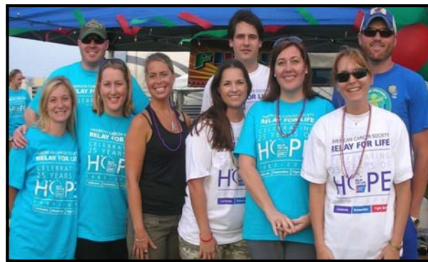
Young Professionals of Martin County raised more than $3000 for the Relay for Life overnight event held at Martin County High School March 27-28. YPMC's "Fiesta" themed tents sold nachos, maracas, Mexican tea cookies and more!