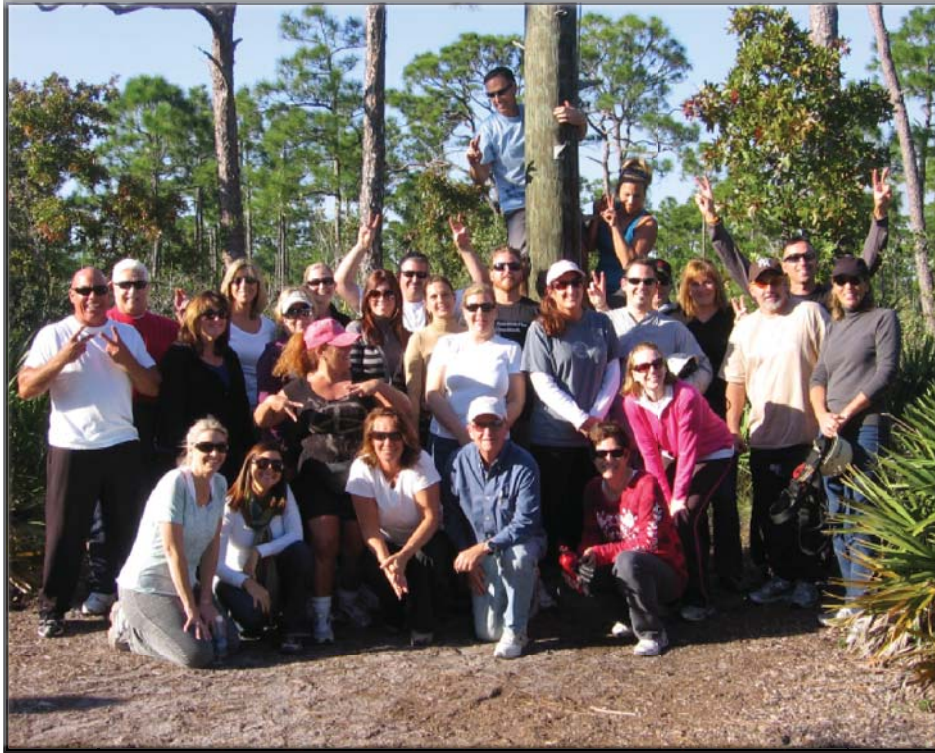
Class "Catch 22" after a day of challenges both mentally and physically on the C.O.P.E. Course at the Tanah Keeta Scout Reservation.