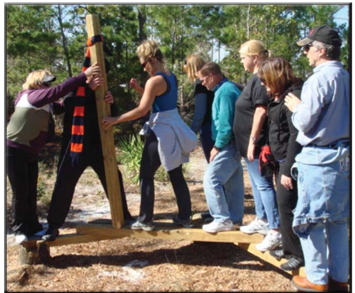
Class 22 learning to make the right moves to stay on boards.